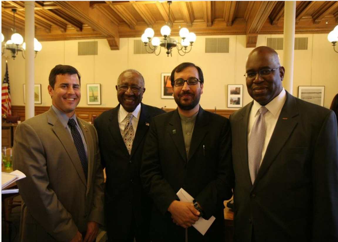
Figure 5. Governor Azizi with Syracuse Common Council President Van Robinson

In Syracuse, Governor Azizi examined and discussed the responsibilities of state and local governments in administering public services, the different roles of federal and state governments, cooperation between public and private sectors, New York State planning boards and public decision-making processes, budgeting processes, and emergency response strategies and procedures.