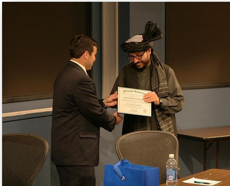
Figure 10. Governor Azizi Receives an Honorary Certificate in Postconflict Reconstruction