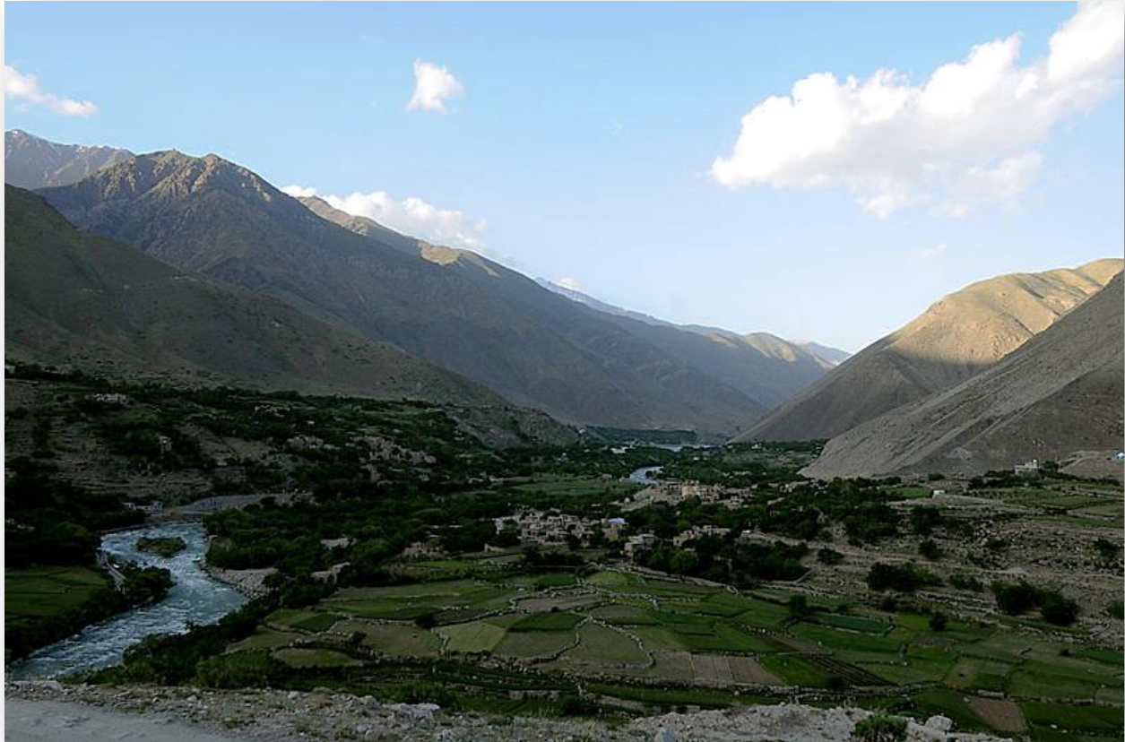
Figure 2: Panjshir River Valley, which flows into the Kabul River Valley (May 2011), from the vantage point of Ahmad Shah Massoud, the Lion of Panjshir's, Tomb.

Situated in foothills of the Hindu Kush, Laghman is well known for its lushness, as the Alingar and Alinshang rivers run through the province, providing a steady source of water for vegetation and wildlife. A major highway also cuts through the center of the province, connecting Kabul and Jalalabad. Agriculture and trade are key drivers of the local economy.