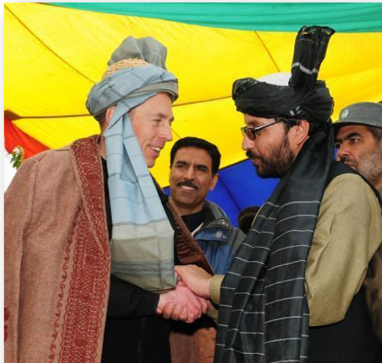
Figure 4. Gov. Azizi with ISAF Commander General David Petraeus, Feb 7, 2011.

In many respects, Laghman Province and Governor Azizi's leadership efforts are on the 'frontline' of Afghan-led reconstruction. What happens here will not only serve as a model for working out political, development, and reform 'kinks' across Afghanistan, but may inform U.S./Coalition strategy toward current and future postconflict states.