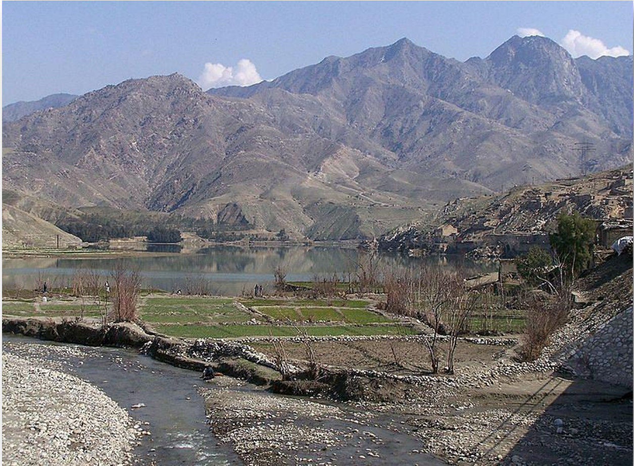
Figure 3: Kabul River in Surobi, Afghanistan (2007)

As a transition test case, Laghman province holds significant potential for the following key issues: (1.) progress in capacity for continued economic growth and development; (2.) advances in security and security force training; (3.) strengthening governance, accountability, transparency, and progress in