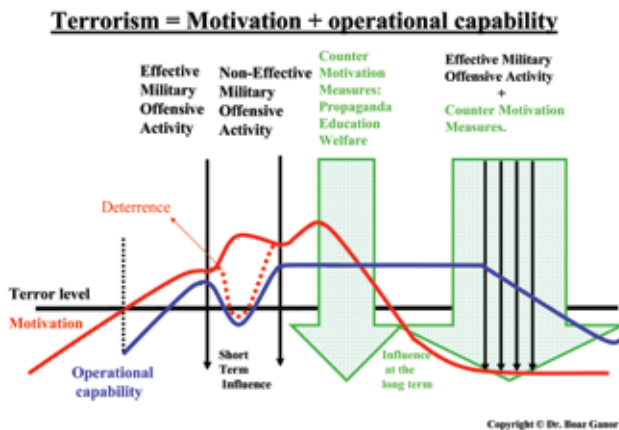
Figure 2 – Types of Non-Conventional Terrorism

The terrorism equation is, as stated, a combination of the motivation to perpetrate terrorist acts and the ability to act on that motivation (Ganor, 2005). These two essential conditions determine the scope and nature of past, present, and future terrorism. From the terrorism equation, we can extrapolate a counter-terrorism equation. When combating terrorism, one must carry out various types of activities aimed at reducing or eliminating the terrorist organizations' ability to perpetrate attacks, and activities aimed at reducing or eliminating the terrorists' motivation to carry out attacks. Naturally, the hope is to diminish both of these variables, but the principal dilemma in fighting terrorism is the fact that the more successful one is in carrying out actions that damage the terrorist organizations' ability to perpetrate attacks, the more we can assume that their motivation will only increase. Figure 2 illustrates this dilemma and pres-