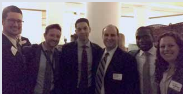
On November 4, 2015, INSCT held its annual alumni reception in Washington, DC, at the Old Ebbitt Grill. This year, the reception was a joint event with the SU Law Office of Advancement, which invited former SU Law students from throughout the Capital Region.